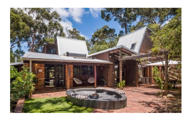
1972 – 2 Binbrook Place, Darlington (2025, realestate.com.au)